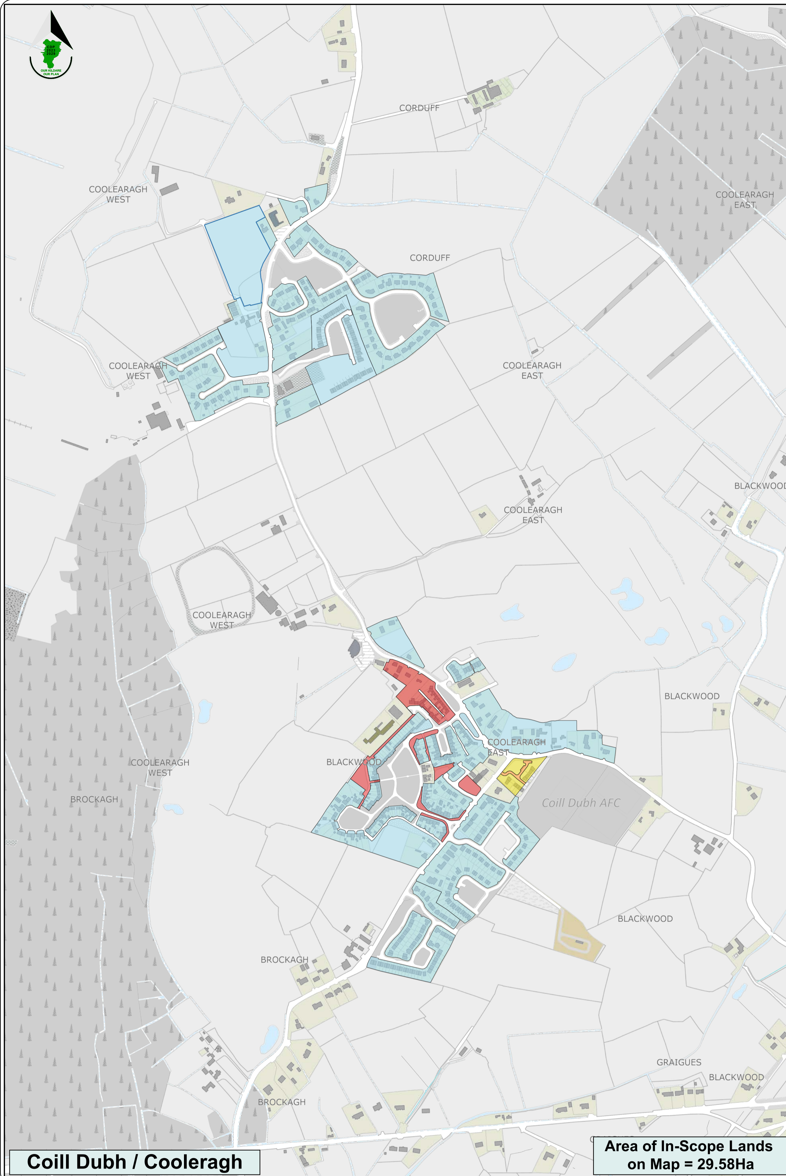
Coill Dubh / Cooleragh